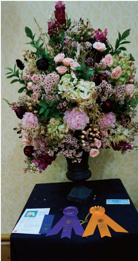
Award -winning Flower Arrangement