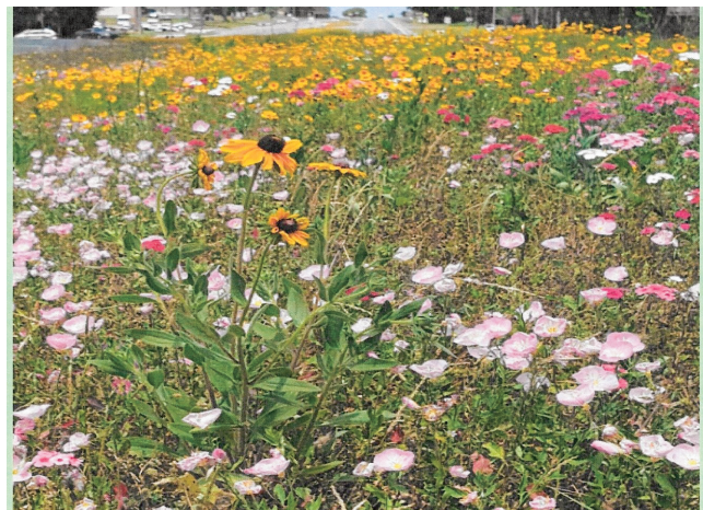
US 41 S. in Columbia County from CR-252 to St. Margaret's Street may be short in length; but not in species of Wildflowers!

Two Naturally Occurring Wildflower projects ; one a 34-mile section of Hwy US 27 from Branford to the Alachua County Line and the other US Hwy 27 from the Ichetucknee River Bridge through Fort White, highlight District II projects where mowing schedules have been carefully planned to allow native wildflowers time to seed and space for continuing naturalization year after year. Yellow Coreopsis basalis and pink Phlox drummondii are visually beautiful for many miles. Each project is a noteworthy example of professional roadside management. Leading by example, Lake City Maintenance shows that roadsides can be safe and appear cared for without destroying wildflower areas. The Lake City approach to conserving roadside wildflowers is impressive and repeatable nearly anywhere along the state highway system.