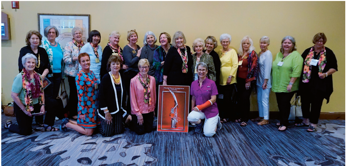
The 2019 'Calendar Girls' pose with a photograph of the Calendar.