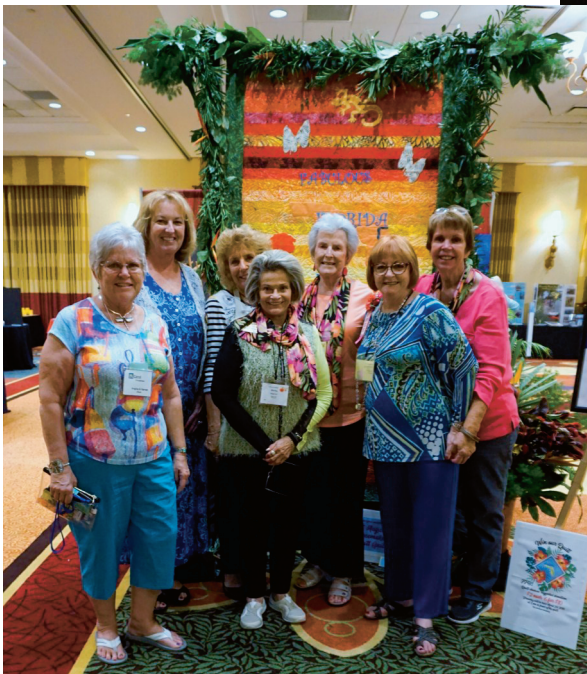
Members of the Flower Show Committee pose at the entrance to the 'Fabulous Florida' flower show