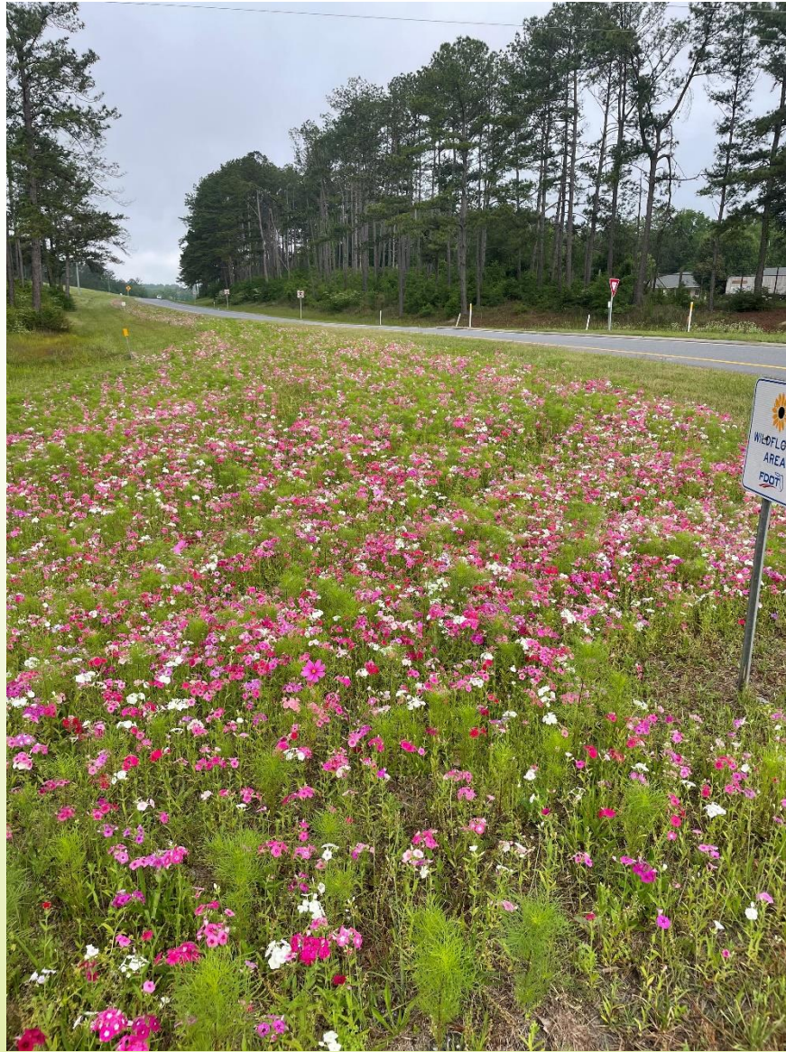
Feathery-foiled Cosmos (not yet flowering) amongst Drummond Phlox