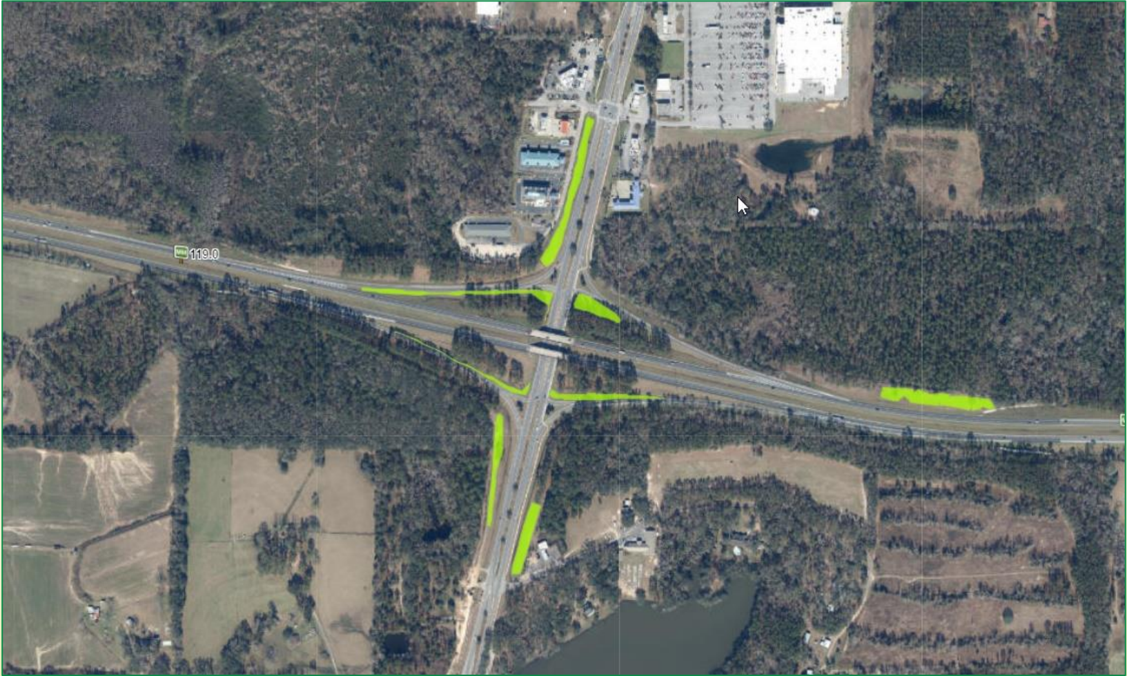
SR-77 at the I-10 Interchange (Washington County) Wildflower areas highlighted in green