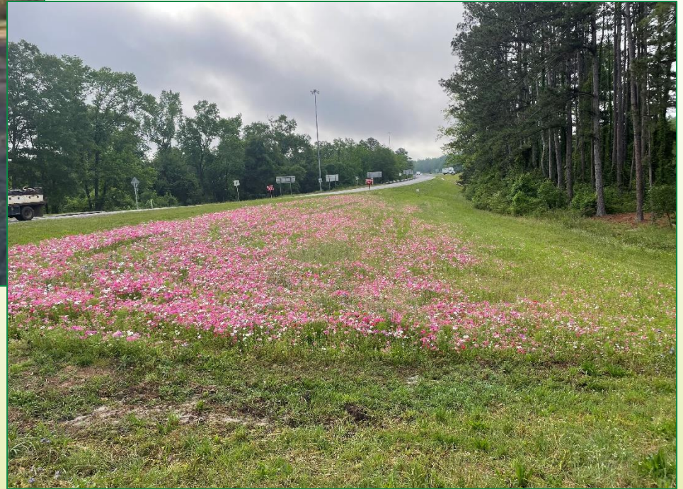
Before and After Photos of Drummond Phlox along SR-77 near the I-10 Interchange (Washington County)