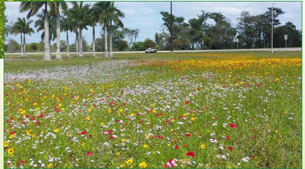
Left: Spectacular display of Leavenworth's Tickseed Right: Existing wildflowers augmented with Black-eyed Susan, Goldenmane Tickseed, and Drummond Phlox