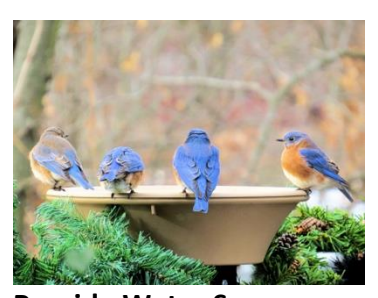
Provide Water Sources Pollinators need sources of water for many purposes, including drinking and reproduction.