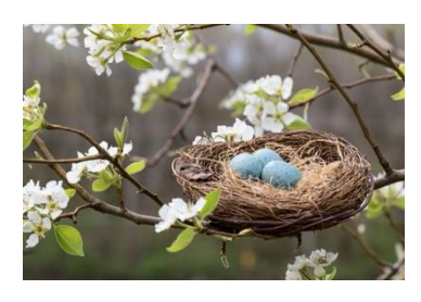
Provide Shelter and nesting sites.

Various kinds of native plants that bloom at different times of year are Needed to provide nectar, pollen, and larval food source.